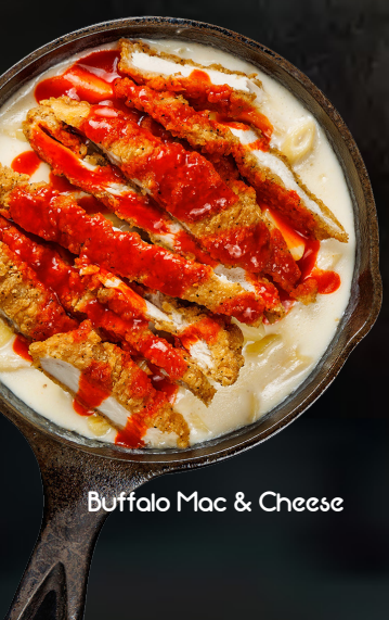
Buffalo Mac & Cheese